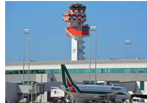
Safety data feeder

Methodology Procedures Monitoring activities Investigations and Safety Assessments