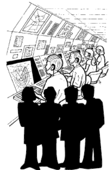
End users (ATCOs)