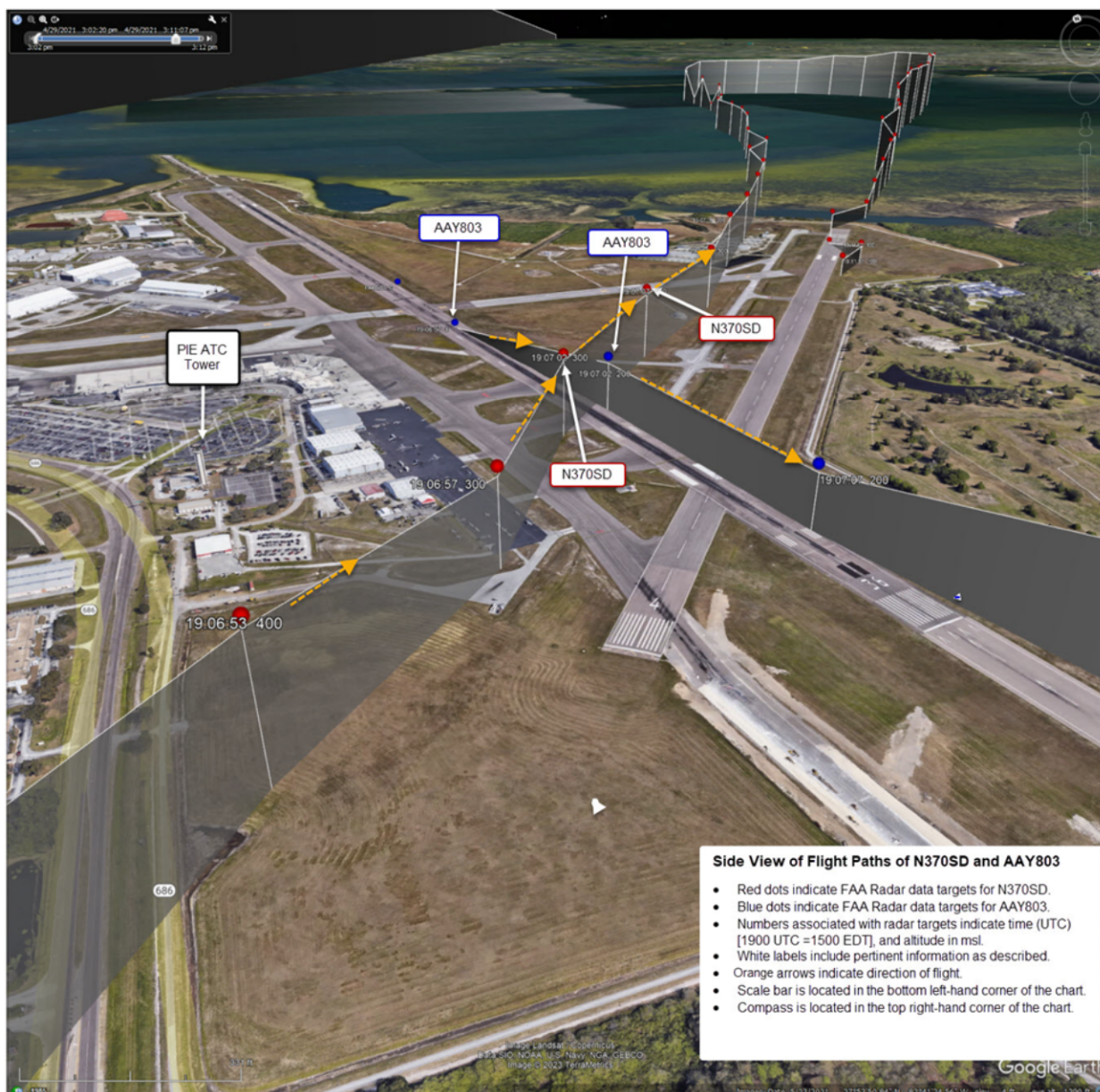
Figure 3. FAA Radar data overlaid satellite imagery illustrating the flight paths of N370SD and AAY803, from a side view perspective.

About 1508, the LC controller advised the pilot of N370SD that he would call his base turn. Then the LC controller instructed the pilot to turn his base and asked what his altitude was. The first part of the pilot's transmission was indiscernible, and although the last part of the transmission was intermittently distorted, the pilot was heard stating, "turn base."